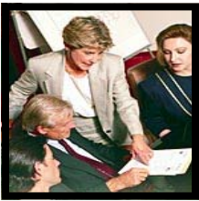
1 Product launched