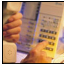
2 Instant Notify Activated