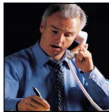
3 Orders Placed