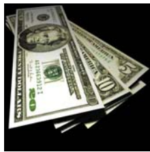
4 Big Profits